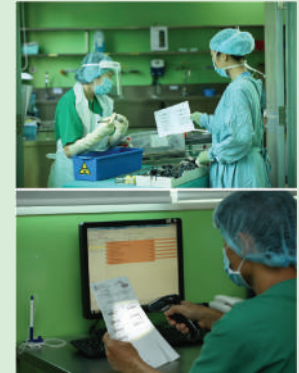
"Receive used surgical instruments" and record information via software